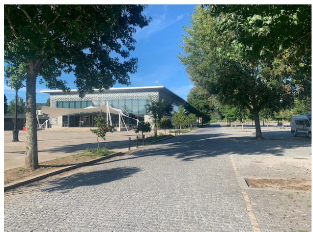
The free car park near the city centre is at your disposal.